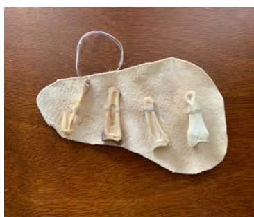
Fishing Hook Construction