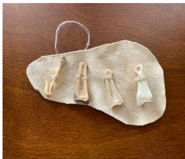
Fishing Hook Construction