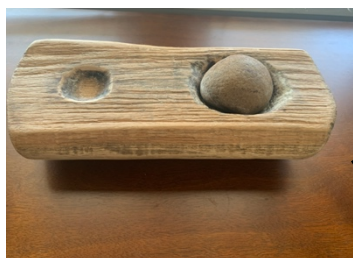
Nut and Berry Grinder